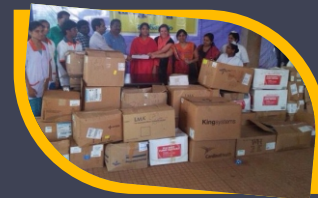
Helping government hospitals with medical supplies