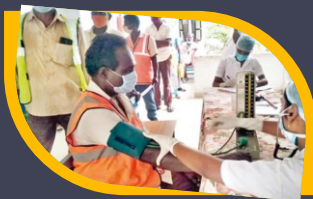
Health camps and doctors visit to factory periodically.