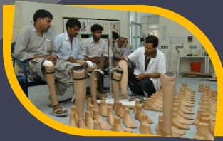
Jaipur foot for handicapped people.