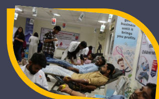
Blood donation, cancer and medical camps.