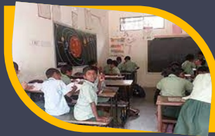
Adoption of primary school near factory.