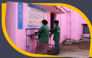
Safe drinking water, sanitation- household, toilets, community hospitals.